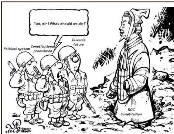
The terra cotta "ROC Constitution general"