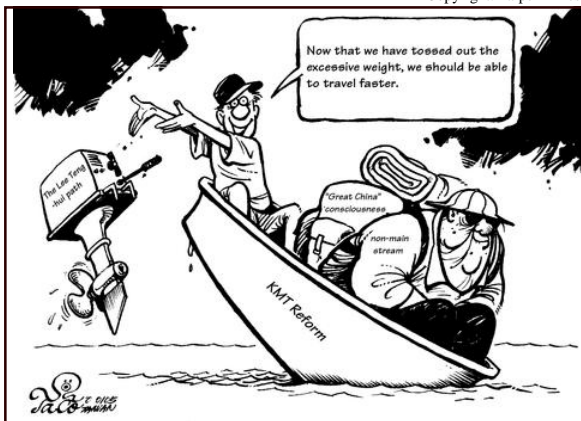
The KMT tossing overboard its "Lee Teng-hui engine"

In the meantime, several of the old pro-unificationists, who left the Kuomintang in 1995-96 to run against president Lee Teng-hui in the March 1996 presidential elections, are now returning to the KMT-fold. Messrs. Chen Li-an, Lin Yang-kang and hardline former general/prime minister Hao Pei-tsun have recently announced they would rejoin the KMT "...to save Taiwan."