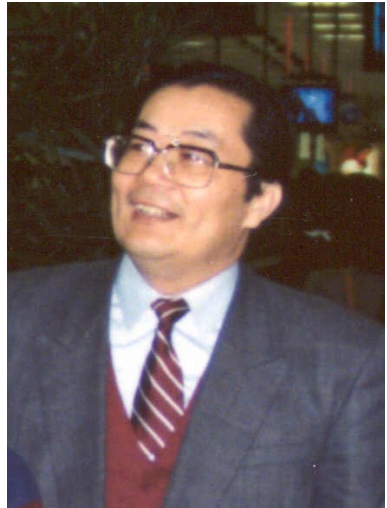
Mr. Chiang Peng-chien

Mr. Chiang was a tireless campaigner for human rights and democracy in Taiwan. In 1980, during peak of the Kuomintang's repression and martial law, he was (together with present President Chen Shui-bian) one of the courageous young lawyers, who stood up to defend the "Kaohsiung Eight", the major opposition leaders accused of "sedition" after the December 1979 "Kaohsiung Incident." He defended Mr. Lin Yi-hsiung, who later became Chairman of the DPP (1998-2000).