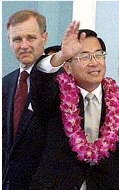
President Chen meeting AIT Chairman Richard Bush in LA

longstanding U.S. policy of recognizing Beijing as the sole government of China—or even as the equivalent of Mr. Lee's 1995 tour, which was itself actually innocuous. By bowing to China's bluster, the Clinton administration implied otherwise, setting a dangerous precedent. This was a pretty blunt example of Chinese interference in American internal affairs. Since when does any foreign government get a veto over where authorized foreign visitors—not to mention members of Congress—may go and whom they may see?