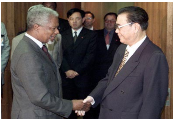
Kofi Annan, meeting "butcher of Tienanmen" Li Peng

We believe that such a position is indefensible and totally wrong: the world should not let itself be intimidated by a repressive and dictatorial China. It should stand up for the principles on which the UN was founded: freedom, democracy, equal rights and self-determination of peoples.