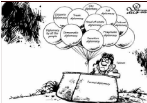
Taiwan's international diplomacy

The major weakness in the platform paragraph is of course the phrase that the Gore Administration “...will remain committed to the ‘One China’ policy”, without defining how this policy differs from the policy espoused by the Communist regime in Beijing. As outlined elsewhere in this Communiqué , the ‘One China’ concept is increasingly viewed as outdated and defunct.