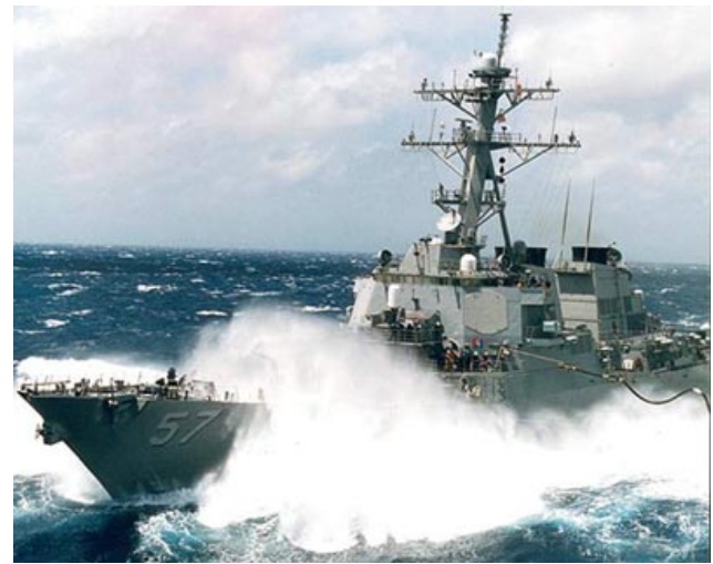
Arleigh Burke class destroyer

Taiwan Communiqué comment: While these systems are still significant, the postponement of the Arleigh-Burke/ Aegis sale is the wrong signal at the wrong time: