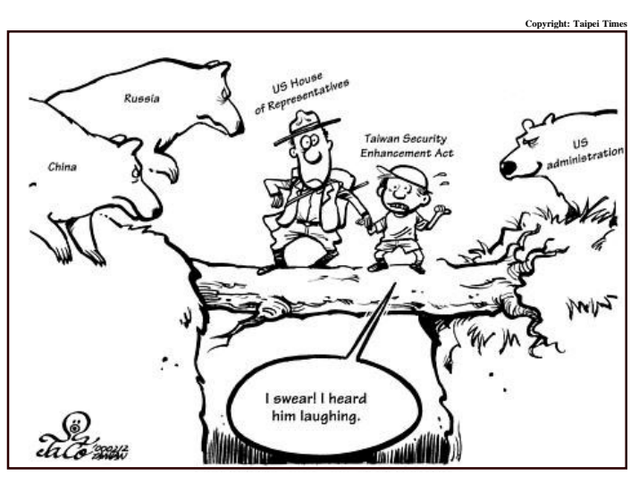
Congress helping the TSEA along

ton) also referred to recent reports that a study by the US Department of Defense has indicated that the Taiwanese military faces a multitude of problems stemming form technological shortcomings, including an inability to adequately defend against air attacks, ballistic missiles. and cruise missiles. These deficien-