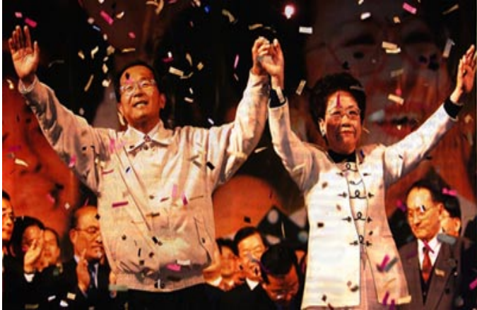
Chen and Lu's victory walk on election night

The underlying theme of the democratization was the quest of the native Taiwanese majority (85 percent) to have a voice in the political system, which was dominated for so many decades by the Chinese mainlanders who came over with Chiang Kai-shek.