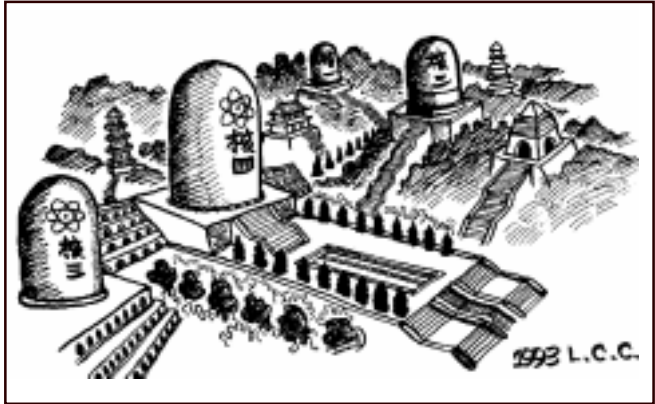
Plenty of nuclear monuments in Taiwan

Taiwan's fourth, in 1994 after six years of delays and protests following the 1986 Chernobyl nuclear disaster in the Soviet Union.