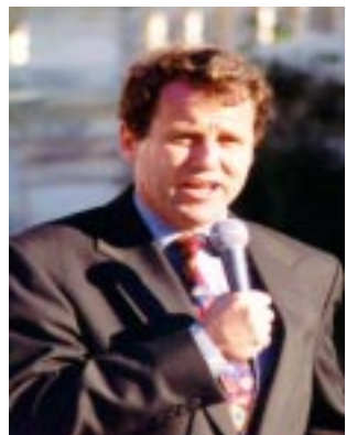
Sherrod Brown addressing Taiwanese-Americans

Therefore, the international community in general, and the United States in particular, should actively