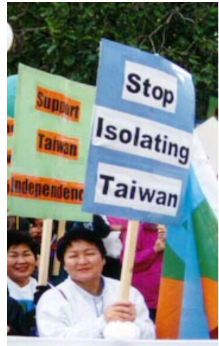
Getting the message through to Mr. Clinton

Taiwan Communiqué comment: Our appeal to the international community is: do not “engage” China at the expense of a free and democratic Taiwan. Do not isolate Taiwan, but pull Taiwan into the international community as a full and equal member. This is the best guarantee for safety, security, and stability in East Asia.