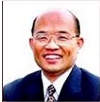
New Taipei County Magistrate Su Chen-chang

Farther to the south, Taoyuan, Hsinchu, Taichung, Tainan and Kaohsiung counties are all held by the opposition. Only Kaohsiung City is still led