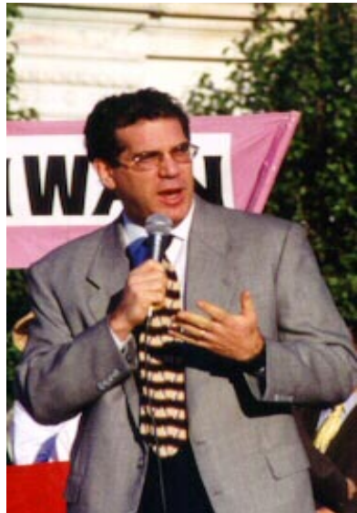
Congressman Peter Deutsch

in the Asia-Pacific region capable of protecting Taiwan from ballistic missile attacks, and cooperative US measures which would provide Taiwan with an advanced local-area ballistic missile defense system.