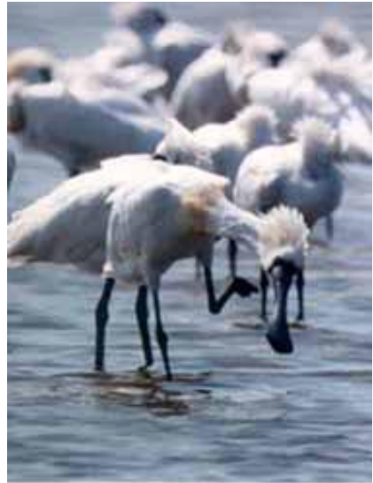
The black-faced spoonbill

The Spoonbill Action Voluntary Echo (SAVE) is a voluntary organization dedicated to an international plan to rescue the potential extinction of the black-faced spoonbill in southern coastal Taiwan. The main goal of this organization is to stop the government's approval of the plan for an industrial complex. Reknowned conservationist, David Brower, has agreed to Chair the committee.