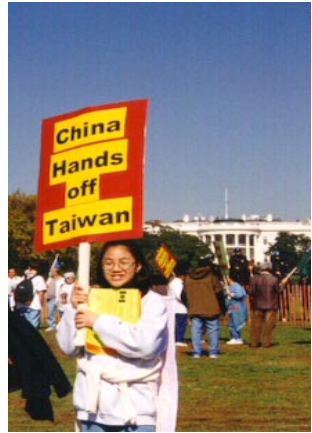
In front of the White House

The crowd then wound its way around the White House just after the Jiang-Clinton ceremony on the White House lawn took place, and got its message across to the guests leaving the ceremony. At Lafayette Park they met up with the Tibetans and Amnesty International supporters preparing for their own gathering, and passed by a group of Chinese human rights activists sitting next to the Old Executive Office Building. Along the way, they chanted "One Taiwan, One China" "China, hands off Taiwan", "China, out of Tibet" "Recognize Taiwan, Taiwan Independence" "Shame on China."