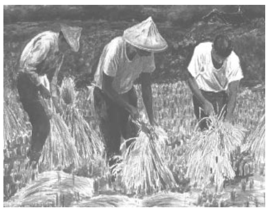
Rediscovering the Taiwanese identity

When given the additional choice of "maintaining the status quo", 43 percent said they wanted to see things stay unchanged. The report remarked, though, that many people on the island main-