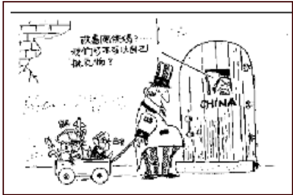
China to the U.S.: "I want to select my own goodies."