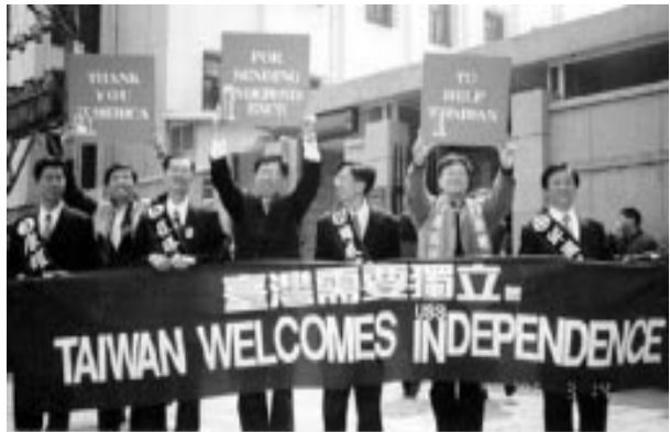
Taiwanese in Taipei welcoming US presence

Taiwan. However, the underlying tension is still there, and the Chinese apparently haven't gotten the most basic message of the episode: that the Taiwanese people want to be left in peace, and do not want to be embraced in a smothering Chinese stranglehold of repression, underdevelopment, corruption, deceit and duplicity. During the past two months, Chinese spokesmen have continued to rant against Taiwan's efforts to raise its international profile.