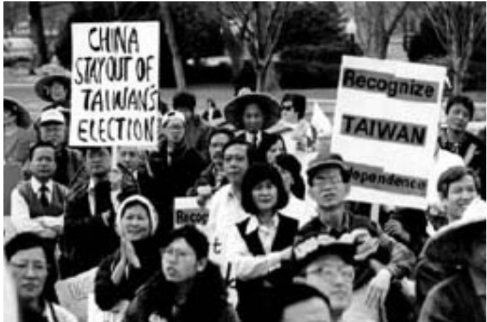
Taiwanese crowd in front of the Capitol in Washington