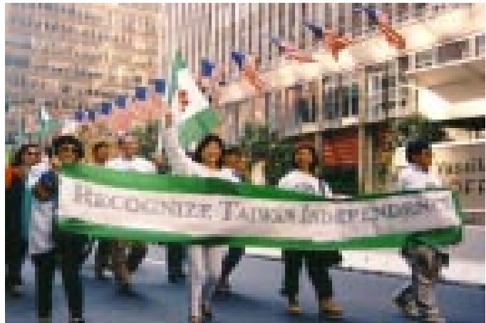
The Taiwanese march for their future

The major reason why this policy is now outdated, is the fact that the Taiwanese have achieved democracy, gained a voice in their political system, and want to be accepted as a full and equal member of the international community. Back in the early 1970s, Taiwan was still ruled by the repressive one-party authoritarian regime of Chiang Kai-shek, who allowed the Taiwanese no say in their political future. The Taiwanese were therefore also not consulted in the decisions, statements and communiqués about the legal status of their island.