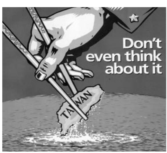
The Economist: timely cover article

On 6 February 1996, the Washington Post states in an editorial ("If China Attacks Taiwan"): "If it came to that, the United States would have no choice but to help Taiwan—a flourishing free-market democracy—defend itself