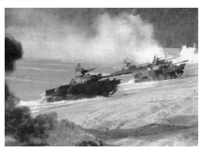
Chinese tanks on military exercises

1) to divert attention from the increasing chaos and power struggle in China itself. What is easier than to play on the Chinese chauvinistic emotions threaten and bully a small neighboring country, Taiwan? That's what Mr. Hitler did in the 1930's in Germany when he invaded Czechoslovakia and Poland, right after