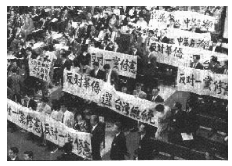
DPP Assembly-members protest "overseas Chinese" vote

This change is a major step forward in Taiwan's democratic reform and represents a victory for party reformers headed by President Lee. The conservative faction of the KMT headed by former premier Hau Pei-tsun is strongly posed to direct presidential election on the