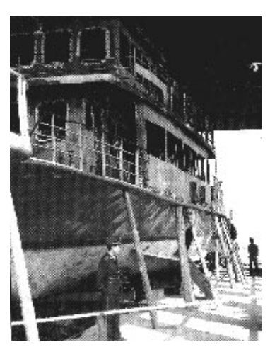
The burnt-out boat at Qiandao

When the news reached Taiwan, it quickly erupted into a major crisis in the relations across the Taiwan Straits. It also led a large number of