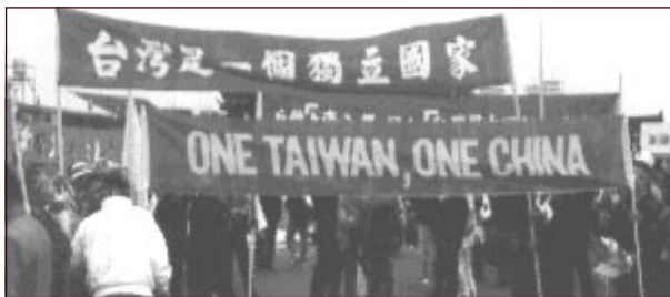
Pro-independence banners at recent opposition rally in Taiwan

However, the approach used by the Taipei authorities is still not quite right. The KMT government continues to present itself as "Republic of China on Taiwan", and strives for a "One China — two seats" representation in the United Nations. This is a non-viable option, which should be discarded right away. A truly representative government should apply for Taiwan to become a new member, simply under the name "Taiwan."