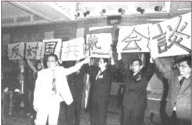
Leading DPP-members in Singapore: "We oppose the talks between the Nationalists and the Communists."

The meeting was held from 27 to 29th April. Hundreds of reporters from Taiwan went to Singapore to cover the event. By all accounts, the Taiwan delegation was a loser, because it failed to obtain an agreement from China for the protection of the estimated $3 billion private investments made by Taiwanese businessmen in the coastal provinces.