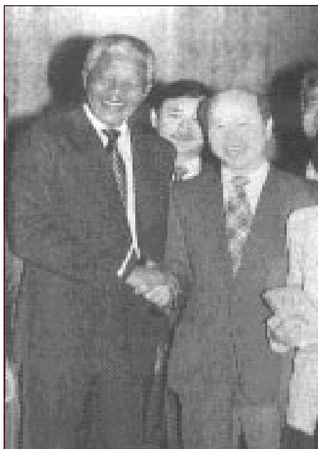
Mr. Mandela with DPP-Chairman Hsu Hsin-liang

Mandela referred the question to Pallo Jordan, ANC director of Information and Communications. Jordan replied: “We appreciate the historical fact that for the last 100 years, Taiwan has existed as a separate entity from China ... We will respect the views of the people of this country (regarding independence) as they are expressed through the electoral process, and we will express our views to the PRC government.” Jordan also urged the DPP to begin a dialogue with Peking, in the meantime.