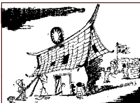
KMT Chairman Lee Teng-hui trying to save the house, while the "New-K" is breaking it down