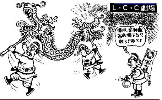
The KMT divided: "Two-headed dragon."

Secondly, the transfer of the premiership from the elderly mainlander hardliner Hau Pei-tsun to the younger Taiwanese technocrat Lien Chan signifies a watershed in the island's political history. It is the first time that the mainlanders, who have held the island's political system tightly in their grip since the end of World War II, relinquish this important position to a native islander.