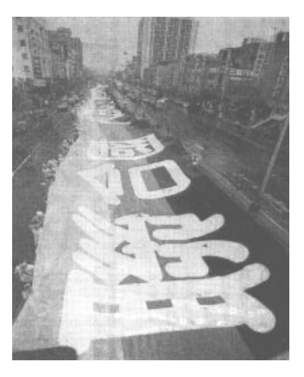
Pro "Join-the-UN" demonstrators, weaving through a rainy Taipei with a 500-meter banner

On 7 and 8 September 1991, the democratic opposition in Taiwan organized a large-scale demonstration in Taipei to commemorate the fact that 40 years ago the San Francisco Peace Conference was held. The opposition wanted to appeal to the Taipei government to end its isolationist policies, to work towards rejoining the United Nations, and to hold a plebiscite on the future of Taiwan.