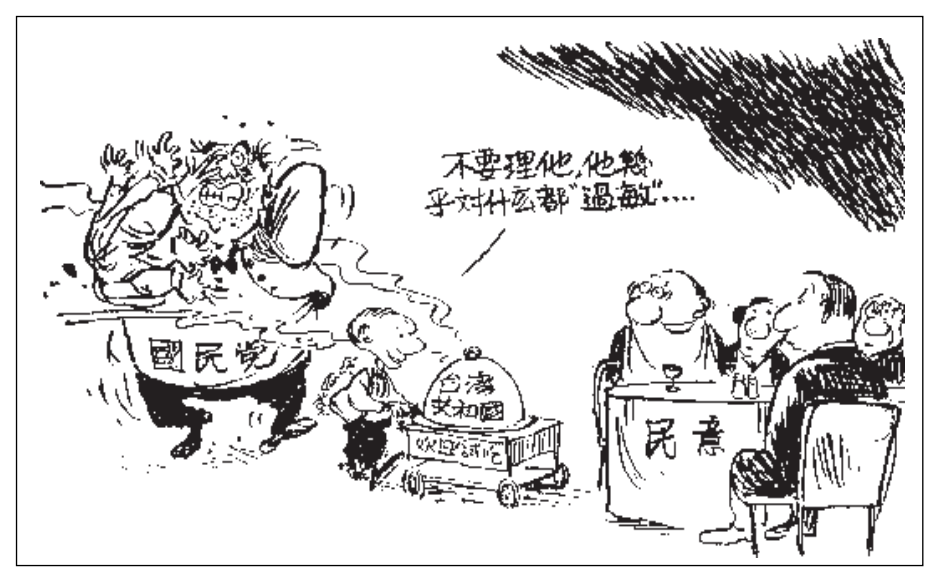
DPP waiter, bringing in New Constitution dish, to guests: "Don't pay any attention to him (KMT), he is always allergic to everything ..."

During the course of the two-day meeting, the most heated debate occurred on the name "Republic of Taiwan." The leadership of the DPP initially felt that the name was too sensitive, and that it would be a liability in the upcoming campaign for the December election of the National Assembly. However, the legal scholars were strongly in favor of using this name, declaring that the opposition needed to make this a major issue if it wants to gain broader support. They emphasized that a new Constitution means a new sovereignty, so it must be specific about the name of the country and its territory.