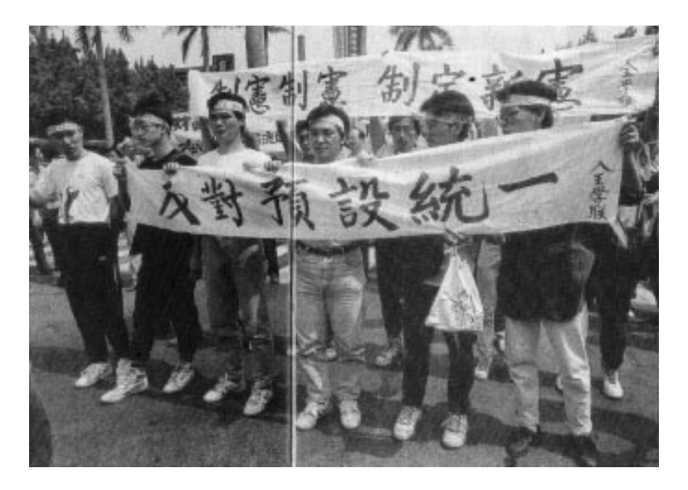
Students in Taipei: "No to reunification with China !"

The students published pamphlets explaining their ideals. The statement in support of Taiwan independence was significant, because it was the first time in Taiwan's history that students in Taiwan itself had openly expressed support of the idea. Until now, the KMT's control of student life on campus had been so tight, that it had only been discussed in private groups.