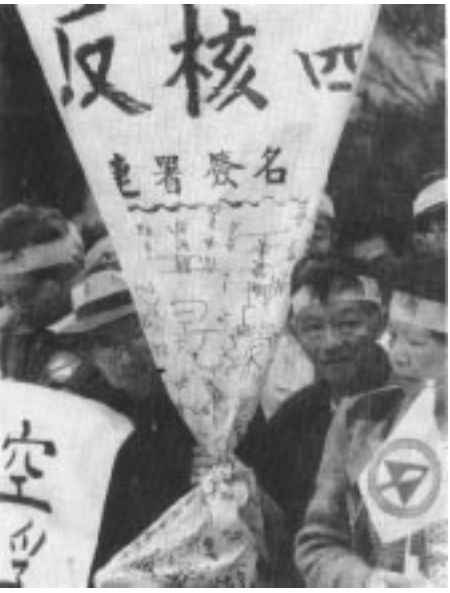
Petition against nuclear power

Premier Hau's statement was strongly criticized by both DPP and KMT legislators, as well as by Taipei County Magistrate You Ching, who argued that the statement would bias the work of the review committee and violated the principle that a decision on the building of the plant would only be made after the