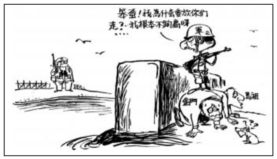
KMT soldier to people of Kinmen and Matsu: "If I let you go, I will not be tall enough"

For the inhabitants of the two off-shore islands Kinmen and Matsu, the termination of the "Period of Communist Rebellion" lasted only very briefly: on 1 May 1991, the very day that the "Period" was lifted, the military commanders on the two islands imposed martial law again, and on the next day, the Cabinet approved the Defense Ministry proposal to impose martial law "ad interim."