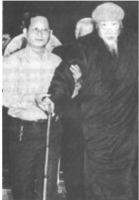
Elderly Assembly member

The results that have come out of the Kuomintang's Constitutional Reform Committee (CRC) since then are even more disappointing. This is perhaps no surprise, as the CRC is stacked with elderly mainlanders and KMT-faithful ! No DPP-members or reform-minded academicians have been allowed on the CRC, in spite of the unanimous proposal by the National Affairs Conference itself that such a broad-based Committee be set up.