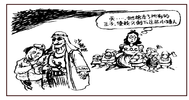
Snowwhite Taiwan: "She (China) has taken all my princes, I am left only with my little dwarfs"

On 8 August 1990, yet another major country, Indonesia, established formal diplomatic ties with the PRC, which had been broken off in 1967 following Indonesian charges of Chinese involvement in the abortive coup d'état of 1965.