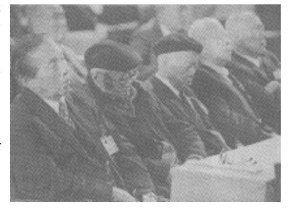
Old mainlander Assembly-members "at work"

On the other hand, the democratic opposition movement of the DPP and the increasingly active student movement organized large-scale demonstrations against the fact that several hundred octogenarians, elected on the mainland more