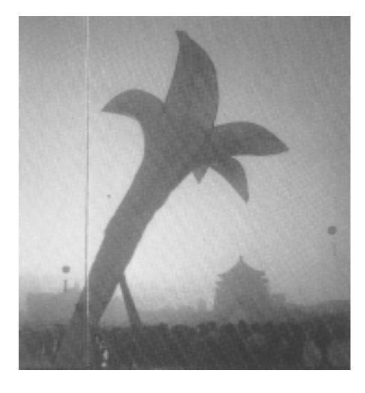
"Wild Lily" at student-demonstration

On 20 March, the number of hunger strikers increased to 40. At the end 62 students joined the hunger strike. On