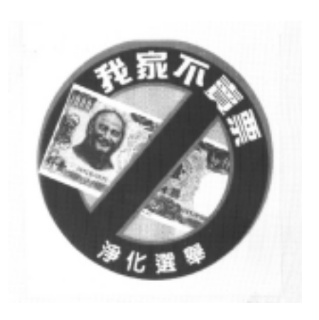
Anti vote-buying sticker of the Clean Election Coalition

* the fact that the elections for the Legislative Yuan are only for a limited number (101) of "supplementary seats". Even if the opposition won 100% of the vote, they would still be in a minority, because at the present time some 163 seats (approxi-