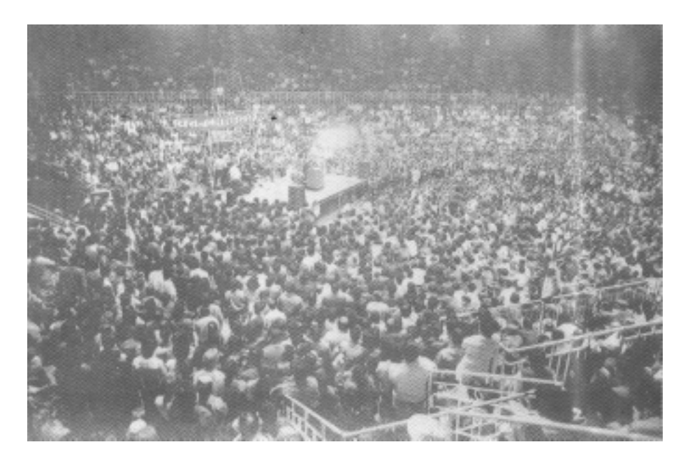
Crowd at Kaohsiung Commemoration on 10 December 1989

At the end of the commemoration, at around 10:00 p.m., several opposition leaders walked along the route of the 1979 incident. DPP chairman Huang Hsin-chieh — a central figure in the 1979 event — urged the Kuomintang authorities to correct the wrongs perpetrated by the authorities in the wake of the incident.