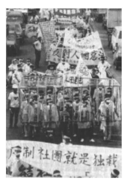
Freedom of Association in a cage

The crowd became angered at the lack of response by the Ministry to their petition, and a melee ensued between the crowd and the police, which had set up a cordon around the Ministry. During the conflict, a number of demonstrators and policemen were injured, none seriously. At 5:07 p.m., the same low-ranking official, guarded by policemen, appeared again to receive the letter of protest, which ended the demonstration.