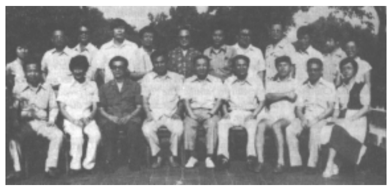
Formosa Magazine staff in the summer of 1979

"I was taken to the An Kang Detention Center of the Investigation Bureau. The interrogation continued non-stop for at least three days. On the fourth day, they let me go back to my cell at midnight. But early in the morning at 5 AM, they took me back for further interrogation.