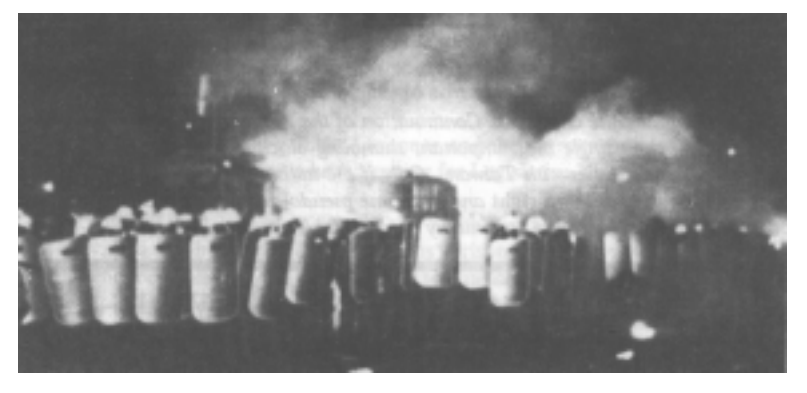
Riot police at Kaohsiung detonate teargas into the crowd

What happened on that fateful evening is history: the human rights day celebration ended in chaos after police encircled the peaceful crowd and started using teargas, and pro-government instigators incited violence (see the account of the event in our publication The Kaohsiung Tapes , which carries a translation of sound tapes made during the evening of 10 December 1979). Newspaper reports right after the event