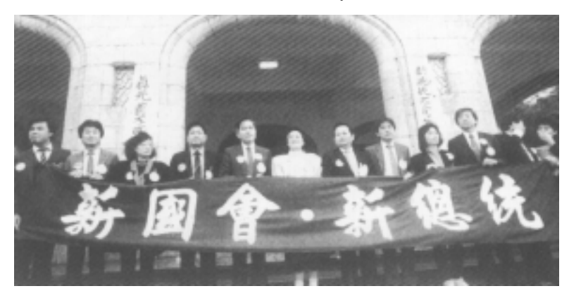
DPP National Assembly members before the Assembly meeting, displaying a banner demanding "New Parliament, new President"

The eleven had planned to display banners appealing for the release of political prisoners, an end to the Kuomintang's "Period of Communist Rebellion" (under which a number of repressive statutes remain in force), and demanding that the Kuomintang authorities formally apologize for the "February 28 Incident" of 1947, when between 12,000 and 20,000 native Taiwanese were massacred by Chiang Kai-shek's troops. The expulsion prevented the opposition members from expressing their concern about these issues, and about the lack of full democracy in Taiwan.