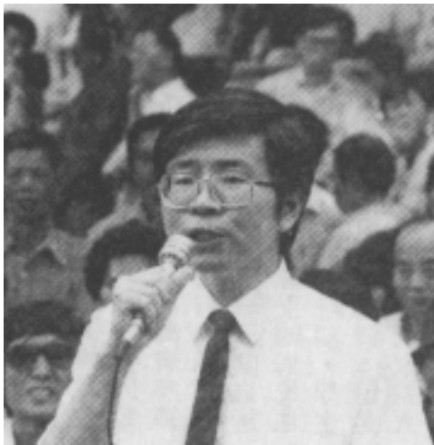
Dr. Hung Chi-chang