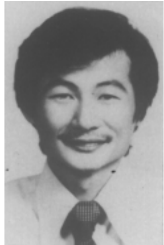
Mr. Shih Ming-teh

All “Kaohsiung” prisoners have now been released — only Mr. Shih remains. Throughout the years, he has steadfastly stuck to his conviction that he was innocent of the political charges against him and that the authorities should thus release him unconditionally. In April 1988, when the authorities announced an amnesty on the occasion of the death of president Chiang Ching-kuo, Mr. Shih’s sentence was reduced