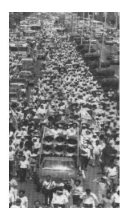
Farmers on the March

At around 2:30 p.m., after the crowd had arrived at the Legislative Yuan, the gathering suddenly and unexpectedly erupted into violence when the police "Thunderbolt Unit" arrested two demonstrators after a disagreement broke out over the use of the restrooms inside the Legislative Yuan.