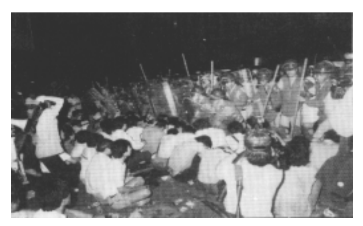
Riot troops attacking sitting students

Many of the wounded demonstrators who were arrested, were beaten and kicked again after they had been taken into custody.