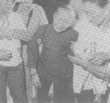
Elderly protester in tears

The demonstration in front of the Legislative Yuan began peacefully. After an inaccurate report that two women, who went inside the legislative building to use the restroom, were detained, the crowd began to push into the legislature. The demonstrators wielding flagpoles and placards and the police wielding batons and shields began to beat each other.