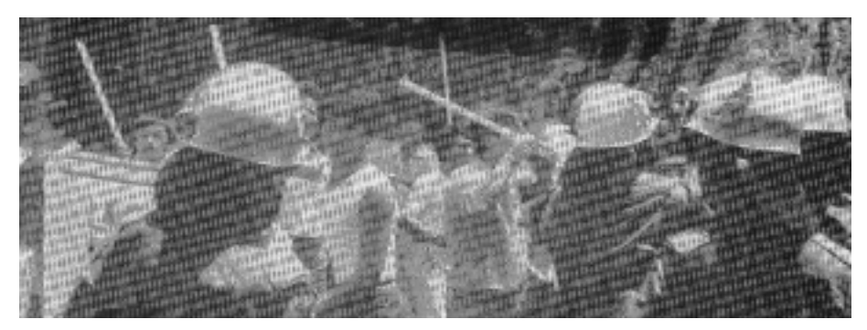
Stick-wielding provocateurs break through police lines

about the present liberalization process (see "The Right lashes back", in the <u>Far Eastern Economic Review</u>, 2 July 1987).