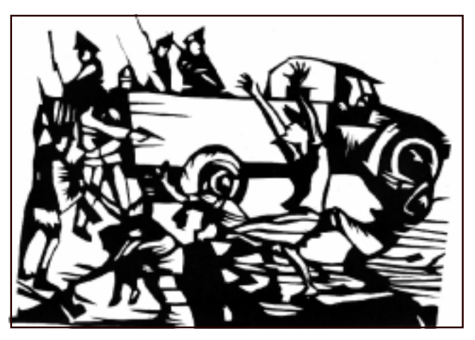
An artist's portrayal of the February 28 Incident

the newly-arrived KMT government. The Chinese Nationalists had begun to come over to the island from mainland China at the end of World War If in 1945. Initially the Taiwanese, who had been under Japanese rule since 1895, welcomed their "brothers" from the mainland. However, the mainlanders considered the island to be occupied area, and plun-