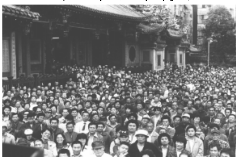
Crowd at opposition rally at Lung-shan Temple

The outcome exceeded all expectations: DPP leaders had cautiously hoped for 10 seats in both houses. The shift towards the DPP was particularly encouraging in view of efforts by the ruling Kuomintang and the government-controlled news media to distort the facts surrounding the confrontations between police and opposition supporters at Taiwan's international airport in Taoyuan (see story on page 15).