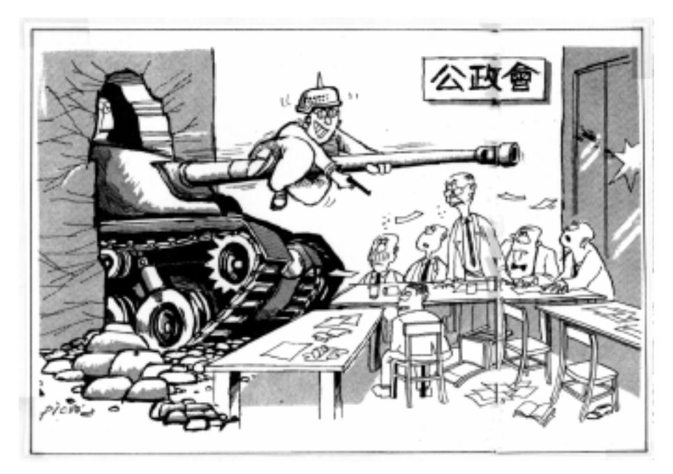
"May I see your permit?"