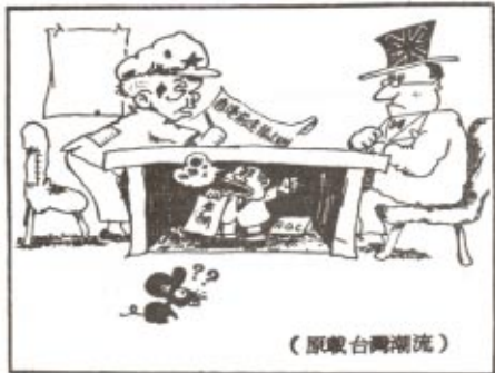
KMT throwing a temper tantrum beneath the Sino-British negotiating table