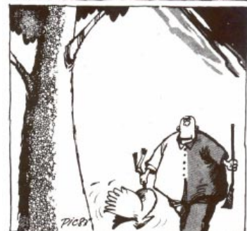
Press censorship in Taiwan: "Another troublesome noisemaker removed."

There are political, and even sometimes financial, rewards for being banned. A ban of a single issue guarantees a sellout, if the ban occurs after the magazine has been distributed. Or, if the magazine is seized at the printers, the publisher sometimes arranges a "pirate" version of the offensive magazine. Magazines banned for longer periods usually come out under a different name.