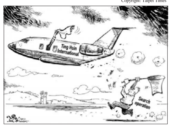
Prosecutors allowing tainted food executives to fly off to China in their private jets

close ties to the Kuomintang party, such as Ting Hsin International, had sold tainted cooking oil, reflecting badly on the Kuomintang government and putting it on the defensive. In a telling story, just as the cooking oil scandal broke, prosecutors did allow Ting Hsin Executives to fly off to China in their private jets. One of the four brothers of the Wei family is now in custody.