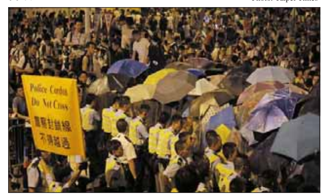
Students in Hong Hong protest

In addition, in both cases, the movement was also a protest against the policies of the local governments: in the case of Taiwan, the Sunflower movement was strongly critical of the lack of good governance and pro-China policies of the administration of President Ma Ying-jeou, while in Hong Kong the student and civic