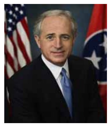
Senator Bob Corker (R-TN)

In addition, the leadership positions of all committees will change. For the Senate Foreign Relations Committee this means that Robert Menendez (D-NJ) will step down, and Bob Corker (R-TN) will probably