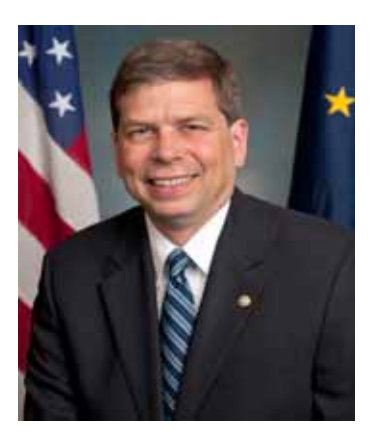
Senator Mark Begich (D-AK)

administration, and push for better relations with Taiwan. This happened in the 1980s during the Reagan administration in the years when the Democrats controlled Congress, and also in the 1990s in the Clinton administration, during the years when the Republicans controlled Congress.