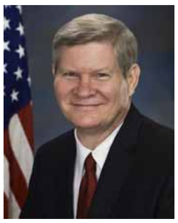
Senator Tim Johnson (D-SD)

In general, it can be said that these election results are good for Taiwan. Traditionally, Taiwan has done well when the US had different parties controlling the White House and Congress. In those cases, Congress was more willing to challenge the