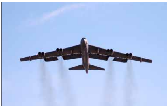
U.S. B-52 bomber in flight

The initial response from Beijing was that they had “ detected and monitored ” the B-52s as they flew through the area for 2 hours and 22 minutes. A Chinese Ministry of Defense statement on Wednesday, 27 November 2013 said that all aircraft flying through the zone would be monitored and that “... China has the capability to exercise effective control over the relevant airspace. ”