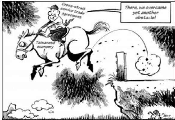
Taiwan's economy horse jumping into an abyss: "There, we overcame yet another obstacle"