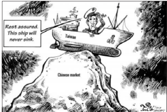
Ma's overreliance on the Chinese market: "rest assured: this ship will never sink"

Ma reiterated his views in a meeting of the Kuomintang Party’s Central Standing Committee on 11 November 2013: he said that cross-Strait relations are not “ state-to-state ”, and that “ China cannot be considered by Taiwan to be a foreign country. ”