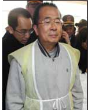
Former President Chen

The letter was titled: “Granting Former President Chen of Taiwan Medical Parole” and read as follows: “Mr. Chen has languished in jail since December 2008 on corruption charges that Taiwan observers claim are politically motivated. Because of Mr. Chen’s present poor physical and mental health, it is time that the former President is granted medical parole on humanitarian grounds so he can receive the treatment he needs.”