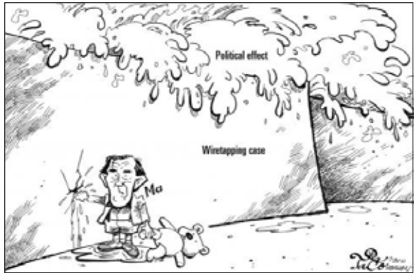
President Ma Ying-jeou, attempting to stem the political repercussions of the wiretapping flood

all Kuomintang legislators. These usually compliant legislators were particularly up in arms about the extensive unauthorized wiretapping operations conducted by the SID, including on the main switchboard telephone line of the Legislative Yuan itself.