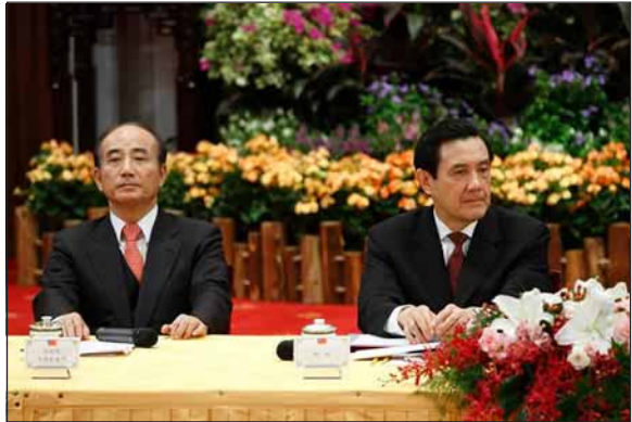
Speaker Wang (L) and President Ma (R): Not on speaking terms

During the previous months, Wang had been trying to achieve a consensus on both issues with the democratic opposition of the DPP and Taiwan Solidarity Union. However, Ma Ying-jeou apparently just wanted to ram the approval of the pact through the Legislative Yuan without much discussion.