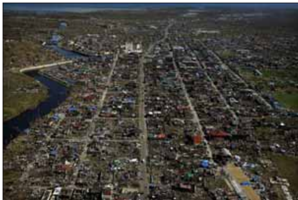
Destruction due to typhoon Haiyan

According to press reports in Taipei, as of 18 November 2013, NGOs and the public had donated some 130 ton of relief supplies worth approx. US$ 2.7 mln., which were flown to the hardest-hit areas in the Philippines in 18 flights by C-130 Hercules transport planes of Taiwan's Air Force.