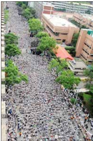
White-shirt crowd protests Ma's policies on 10 October 2013

The presidential speech raised eyebrows as he stated that “cross-Strait relations are not international relations.” More on that topic below.