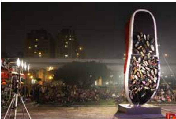
The shoe as a central symbol of protest