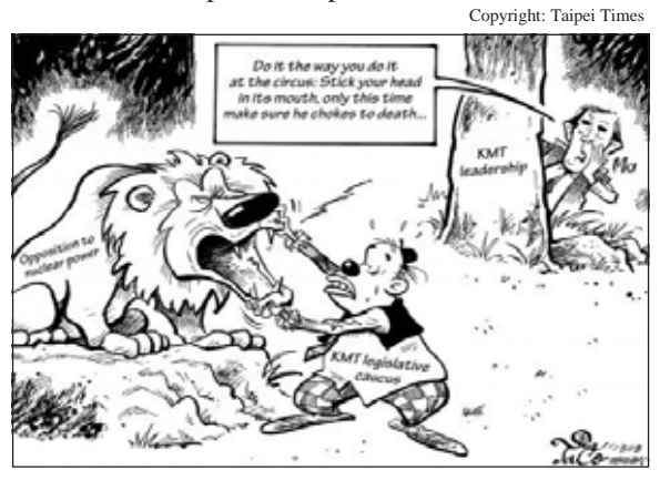
President Ma Ying-jeou to KMT legislative caucus: "Do it the way you do it at the circus: Stick your head in its mouth ..."

One of the speakers was former DPP Prime Minister Chang Chun-hsiung, who in 2000 decided to halt construction of the Fourth Nuclear Plant. However, Taipower and special interest groups subse-