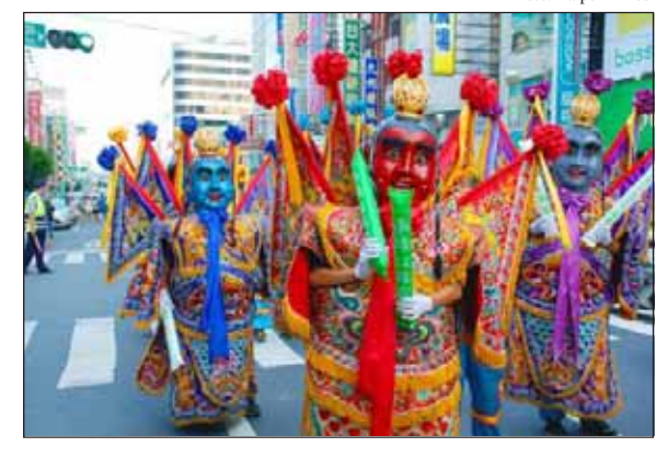
Protest against the Service Trade Agreement in Pingtung in Southern Taiwan on 28 July 2013, with the help of local folk deity Nezha

However, the agreement still needed to be ratified by the Legislative Yuan: this proved to be a difficult process. Below