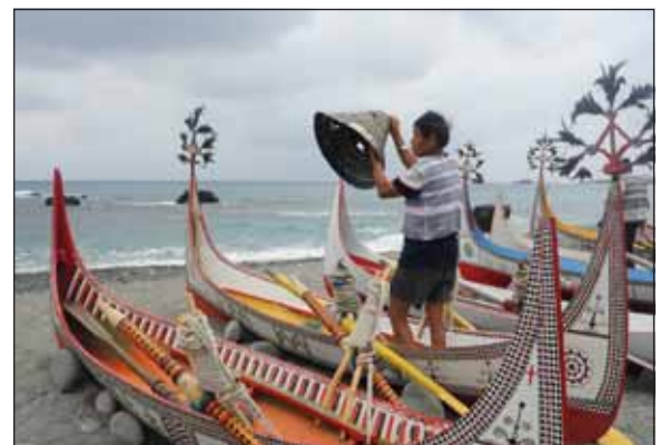
Picture of fisherman on Lanvu Island, off the Southeast Coast of Taiwan

Now, there is another field which does provide ample evidence of the close ties between the Pacific islanders and Taiwan's aborigines: modern photography. Through the artistic lens of photographer Danee Hazama of Tahiti, French Polynesia, the shared cultural heritage between the peoples of the Pacific Islands and the indigenous people of Taiwan becomes quite apparent.