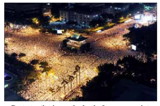
Protest gathering on the death of army conscript Huang Chung-chiu in Taipei on 3 August 2013

1. The death of conscript Hung Chung-chiu on 4 July 2013 while undergoing excessive disciplinary measures in military detention. Anger about the handling of the case by the Kuomintang and military authorities brought out some 30,000 people on 20 July and some 250,000 people on 3 August 2013.