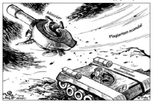
Defense Minister Andrew Yang loses his job over plagiarism allegations

According to press reports in Taiwan, the military judicial authorities were slow in investigating the case, while a key 80-minute portion of footage from cameras monitoring an area of a military detention barracks where the 23-year-old Hung was forced to perform strenuous exercises as part of his punishment, was blank because all 16 cameras had stopped working. The matter prompted the Legislative Yuan to pass legislation