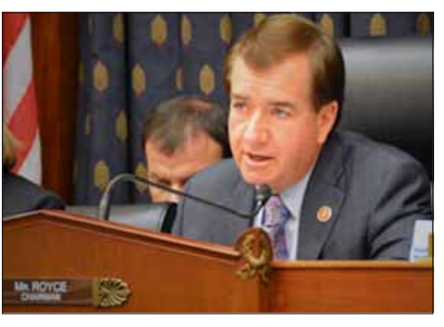
House Foreign Affairs Committee Chairman Ed Royce: TPA to go to the House floor in the Fall of 2013

It is a comprehensive bill that addresses over a dozen different aspects of the U.S.-Taiwan relationship, and updates the 1979 Taiwan Relations Act (TRA) to reflect the new realities in the U.S.-Taiwan relationship. The TPA builds on the TRA (which has functioned effectively as the cornerstone of US-Taiwan relations over the past three decades). It does not amend or supersede the TRA.