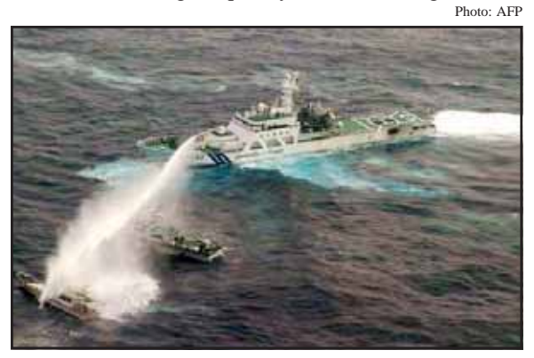
Japanese and Taiwanese Coast Guard vessels engaging in water-cannon fight on 24 January 2013

Japanese 12-mile contiguous zone, and sometime even into the Japanese territorial waters around the islands. According to Japanese press reports this has occurred almost daily in the period since early October 2012. News media from Japan also reported that Japanese fighters had to be scrambled as many as 91 times to ward off incoming Chinese aircraft during that time.