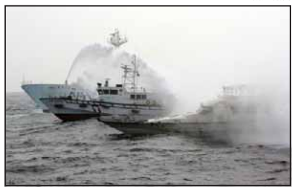
The water-cannon fight between the Japanese and Taiwanese Coast Guard from another angle

One issue for U.S. policy concerns trends across the Taiwan Strait since 2008. particularly the question of whether Taiwan's moves to engage more closely with the PRC have created a greater willingness in Taipei to cooperate