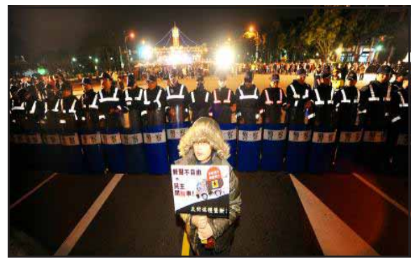
Student protester in front of police barricade near Presidential Office

A controversy erupted in early December 2012, when the Ministry of Education sent an email to university administrators around the country telling them to "show concern" about the participation of students at the various anti-monopoly protests going on. The students reacted angrily, and staged more protests. At one such event, more than 300 National Tsing Hua University (NTHU) students took part in a rally on