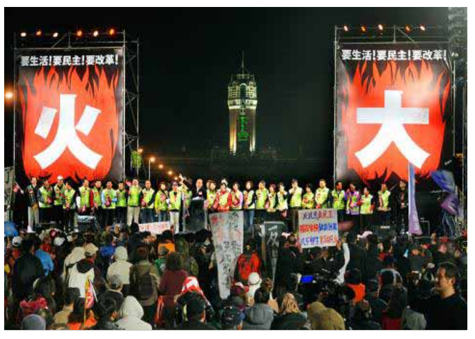
Leading members of the DPP speaking to the crowd against the backdrop of the "Fury" characters and the Presidential Office in Taipei on 13 January 2013

The main theme of the gathering was "Fury":