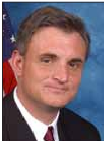
Robert Andrews (D-NJ)