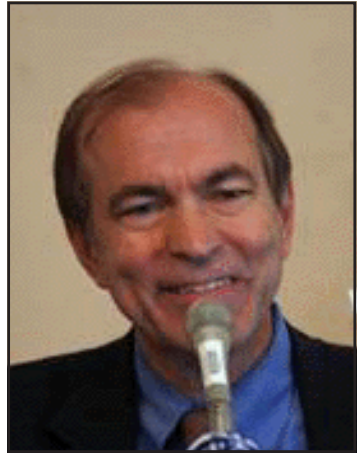
Scott Garrett (R-NJ)

Taiwan’s economy is among the largest and most developed in the world, and it has been hailed as a stable and democratic role model for the rest of Asia. Yet its population of 23 million people has virtually no representation in the UN or its affiliated organizations, such as the International Civil Aviation Association, the International Maritime Organization, and the World Health Organization (WHO). Without membership in the WHO, Taiwan is excluded from the global epidemic surveillance network, putting both the Taiwanese people and the global community at risk.