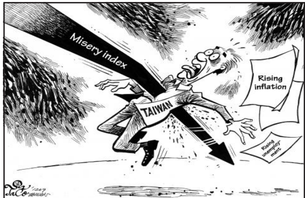
The Misery index is rising

In a poll released on 27 September 2012 by the highly respected Taiwan Indicator Research Survey (TISR) , President Ma’s support level dropped to 16.7%, while the level of trust in him and his government went down to 23.6%. The disapproval rating rose to the highest ever (71.7%), while the distrust topped out at 58.1%.