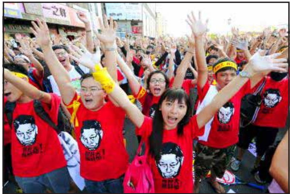
September 1st protest against Want Want monopoly

Tsai reportedly already controls three Taiwan newspapers, a TV station, various magazines, and a cable network. According to the Washington Post, the media he controls have veered sharply toward a more pro-China line. Tsai also used his money and publications to influence the outcome of the January 2012 elections ( Washington Post , “ Tycoon prods Taiwan closer to China ”, 21 January 2012).