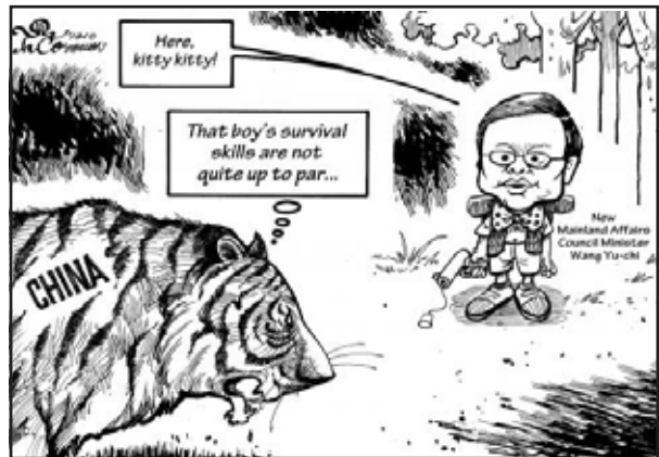
New Mainland Affairs Chairman Wang Yu-chi facing the Chinese tiger: "Here Kitty, Kitty."

Mainland Affairs Council Chairperson Ms. Lai Shih-yuan will step down and move to Geneva as the representative to the World Trade Organization. She will be succeeded as MAC Chairperson by Mr. Wang Yuh-chi, who until now served as National Security Council advisor. Ms. Lai was often at odds with the Ma administration, which left her to defend indefensible positions on cross-Strait issues. She will be happier in Geneva.