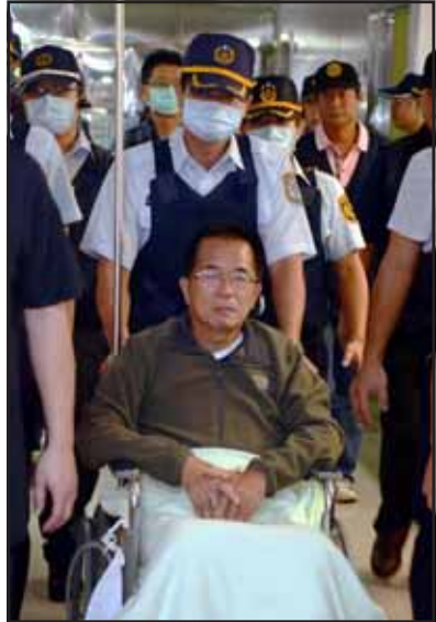
Former President Chen being moved to a hospital

Since that time the physical and mental health condition of the former President have seriously deteriorated. He was hospitalized again on September 12 th 2012. At the Taoyuan General Hospital they treated him for prostate problems, but also discovered a blood clot in his right frontal lobe, indicating he had suffered a minor stroke. The former President also developed speech problems.