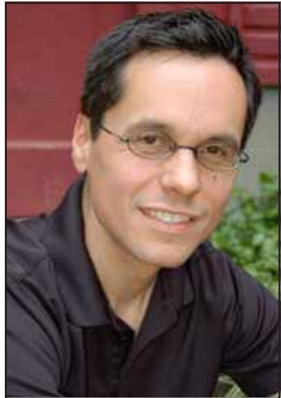
Author Tonio Andrade

The situation eventually prompted negotiations in which Coyet was able to ensure free passage for himself and other Dutch at the fortress. In total some 630 Dutch and 9,000 Chinese combatants had been killed, in addition to several thousand aborigines, fighting on the side of the Dutch. In addition, Koxinga killed several hundred Dutch missionaries and teachers in surrounding villages.