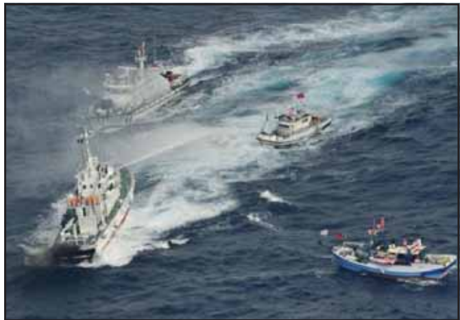
Japanese and Taiwanese Coast Guard vessels engage in water-cannon fight near the Senkakus

The next wave of tension occurred in mid-September, after the central government in Japan announced its decision to purchase three small islands in the Senkaku archipelago from its private owners in order to forestall the governor of Tokyo, Shintaro Ishihara, from purchasing the islands in order to push his nationalistic claims.