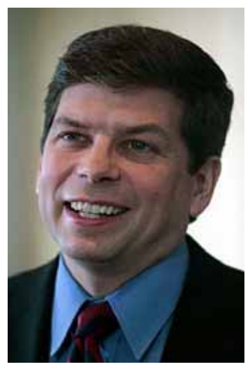
Senator Mark Begich (D-AK)