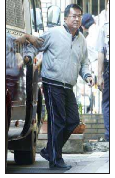
Former President Chen on his way to a recent Court appearance

The report issued by the team in early July 2012 concluded that: "Because it is not easily predictable how much CSB's incarceration conditions need to improve to prevent further serious physical and mental damage such as adjustment disorder or PTSD (Post Traumatic Stress Disorder)...medical parole is the most appropriate effective treatment intervention."