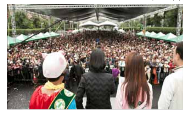
Tsai Ing-wen address a crowd of tens of thousands at the piggybanks homecoming

The DPP returned the piggy banks and the money, but the episode caused a backlash against the Ma administration for its heavyhandedness. In the following weeks, the DPP had tens of thousands plastic piggy banks made, colored yellow, red, blue and green. These flew off the shelves and resulted in a wave of support for Tsai's candidacy.