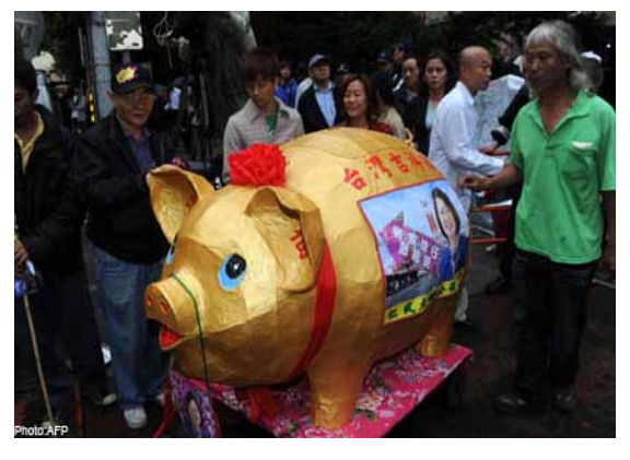
Piggybanks of all sizes were presented to the DPP

mony and cross-strait peace, as well as a sustainable environment and just society.