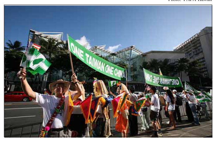
Taiwanese-Americans in Hawaii rallying in support of their homeland

of the international community for too long. It is a member of APEC, but Taiwan's level of representation is not on par with that of the other APEC members. This is unfair and it needs to change. After all Taiwan is a sovereign, independent country; just like the other APEC members."