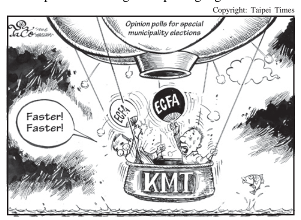
ECFA not helping in sinking balloon of opinion polls for special municipality elections

Democratization in the late 1980s and early 1990s changed all that, although the partisanship in some publications remains, while many people are still reluctant to answer queries from government organizations for fear of retribution, a leftover from the bad old days.