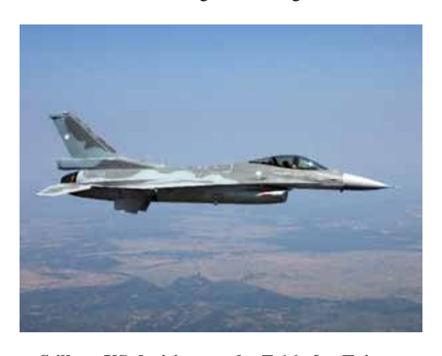
Still no US decision on the F-16s for Taiwan

Two main points stand out which are of great importance to Taiwan and its future: China's intensified efforts to develop capabilities that would deny the United States access to the Western Pacific Rim in times of crisis, and the fact that in spite of the socalled "rapprochement" going on between the PRC and Taiwan, China is continuing its military buildup and missile deployment aimed at Taiwan.