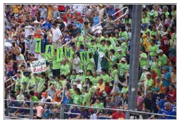
Green-clad supporters of Taiwan's Little League team at Williamsport

The championship tournament, held in South Williamsport, Pennsylvania, is a big deal, drawing top Little League teams from around not only the United States but also from Europe, the Caribbean, Latin America, Asia, and the nations of the Pacific. The games are televised on ESPN and, for the final weekend, are covered by ABC, with top-of-the-line announcers doing the playby-play color and commentary.