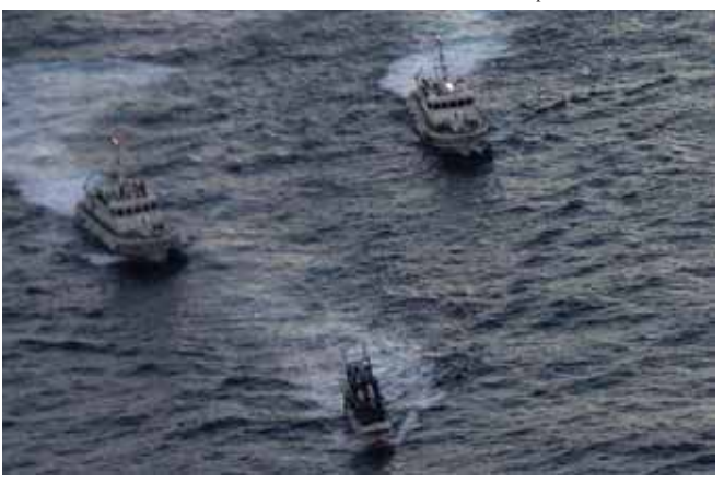
Japanese Coast Guard vessels chase intruding fishing boat from Taiwan out of the waters near the Senkaku Islands

The situation around the Korean Peninsula went from bad to worse at the end of March 2010 when a torpedo sank the South Korean navy corvette Cheonan , killing the 46 sailors on board. When an