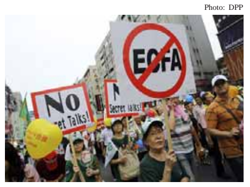
Anti-ECFA placards at rally in Taipei

As expected, in this third "Reading" on the floor of the legislature – which lasted some 10 hours of clause-by-clause deliberations – the DPP proposed 18 motions with amendments, which were all voted down on a party-line vote. Then the