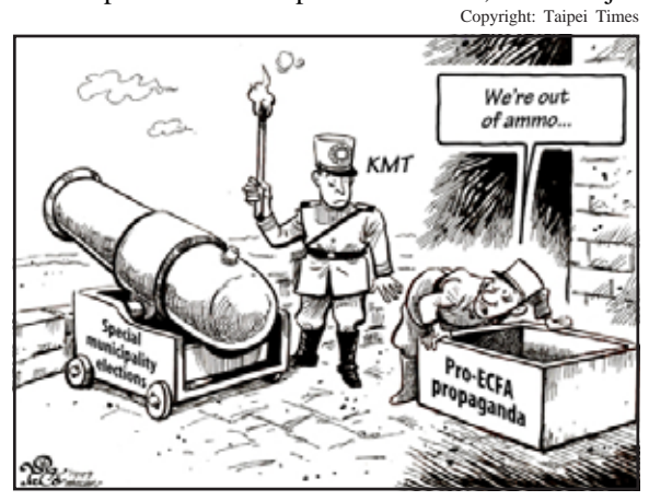
KMT artillery officers: "We're all out of pro-ECFA propaganda."

Such an outcome would represent a vote of noconfidence in the policies of the Ma administration, which came to power in 2008 on a platform of improving the economy, good governance, integrity and getting rid of corruption. On none of these points has the Kuomintang government scored well: