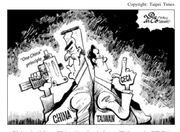
China's \it ''One \it China'' principle \it vs. Taiwan's \it CECA

Whatever its form, it would be an agreement between a very large China and a very small Taiwan: any sense of balance would be gone, and the interests of China