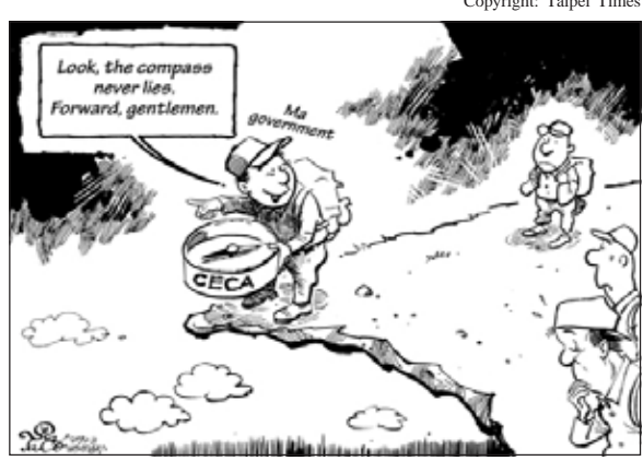
Ma government: "Look, the compass never lies. Forward gentlemen!"

In the initial discussion, the agreement was referred to as Closer Economic Partnership Agreement (CEPA), but when it was pointed out that the form and structure of