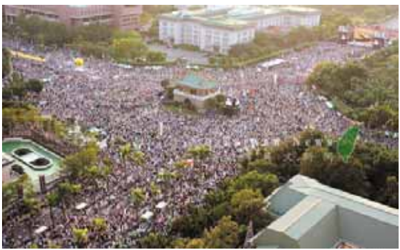
Massive crowd in Taipei on October 25th 2008

By 5:00 pm the five separate marches had converged on the large square in front of the Foreign Ministry and