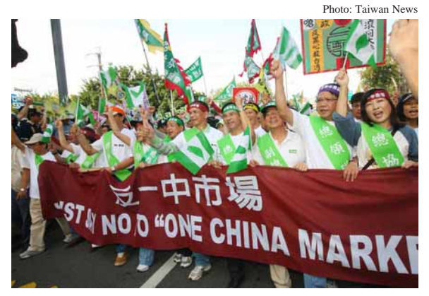
Banner: Say NO to "One China Market"

Opposition to "Made in China" toxic goods, especially melaminelaced milk;