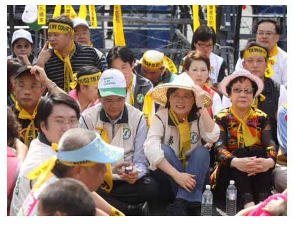
DPP Chairwoman Tsai Ing-wen and other DPP leaders at ''Yellow Ribbon'' protest

Traffic in the streets of central Taipei came to a total standstill as the protesters moved, on foot and in vans equipped with loudspeakers, towards the Grand Hotel, in the northern part of the city. The procession moved along a route planned by the DPP, and was peaceful, but in a number of other locations skirmishes occurred between people and police armed with riot shields and clubs. A number of people on both sides were injured.