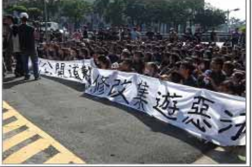
Students in front of Executive Yuan: the banners read "Apologize" and "Amend the (Assembly) Law"

sprang up, and students organized local sit-ins in support of the one in Taipei. The movement was quickly dubbed "Wild Strawberry Movement", after the "Wild Lily" student movement of 1989-91, which helped bring about democratization in Taiwan two decades ago.