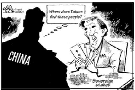
Mr. Ma showing all his cards in poker game with China over sovereignty stakes

Until now, the basic position of the international community has been that China and Taiwan should maintain the "status quo" and not take steps that would change the balance across the Strait. Most countries do consider Taiwan a de facto independent country and have applauded its transition to democracy in the late 1980s and early 1990s. They have also emphasized that Taiwan's future should be resolved