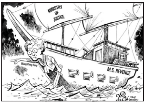
The KMT government's Ministry of Justice: H.M.S. Revenge

It is obvious that there have been cases of corruption in Taiwan, but these have occurred in both political camps. The political neutrality of the judicial system is an essential element in a democracy. It is also essential that any accused are considered innocent until proven guilty in the court of law.