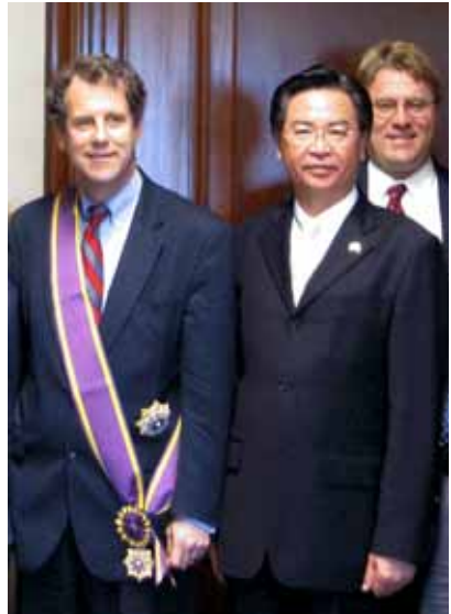
Senator Sherrod Brown receiving the Order of the Brilliant Star from Taiwan Representative Dr. Joseph Wu

Recipients were: co-chairs of the House Congressional Taiwan Caucus Reps. Steve Chabot, Shelley Berkley, Dana Rohrabacher and Robert Wexler, co-chairs of the Senate Taiwan Caucus Senators Tim Johnson and James Inhofe, and ranking member of the House Foreign Affairs Committee Ileana Ros-Lehtinen and Senator Sherrod Brown.