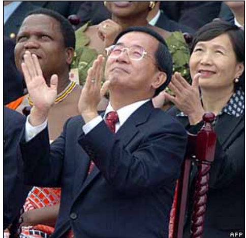
President Chen Shui-bian put emphasis on the Taiwanese identity