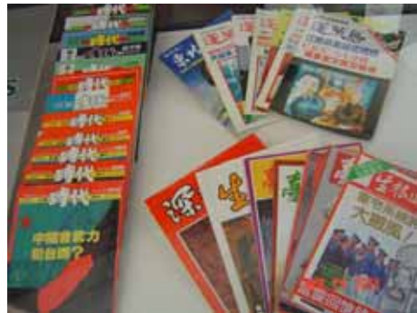
Display of tangwai magazines at the GWU Taiwan Resource Center

One of these databases, for example, provides full-text access to over five hundred journals published in Taiwan. While some of these databases are available in several other libraries in the United States, no other library has more than two, making the Taiwan Resource Center a magnet for researchers from around the country. The Center has also created an extensive research guide for the study of Taiwan, including links to online many resources that can be accessed through the Center’s website.