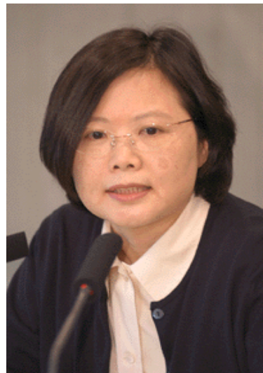
New DPP Chairperson Dr. Tsai Ing-wen

The election rings in a new era for the DPP, which was battered by a severe loss in the January 2008 Legislative elections, followed by a drubbing in the March Presidential race. Tsai has the unenviable task of pulling the DPP out of its down-and-out position, trying to reform and reinventing the party, and bringing it to a position where it can play the important role in checks and balances vis-à-vis the KMT government.