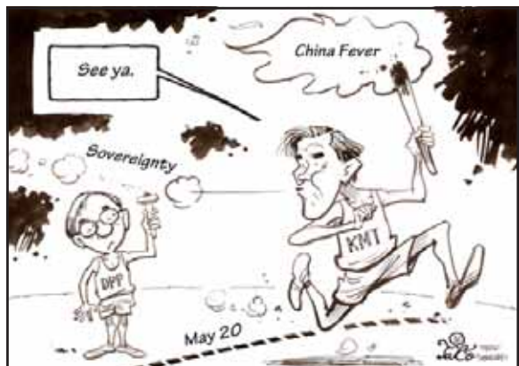
Mr. Ma, with the "China fever" torch, snuffing out Chen Shui-bian's "sovereignty" torch