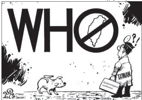
The World Health Organization says no to Taiwan

If the WHO is to be taken seriously, then Taiwan the missing link must be restored without further delay. As a major hub for trans-Pacific cargo and travelers and migrating birds alike, Taiwan is already in a precarious position. With its geographic importance, Taiwan is exceptionally susceptible to outbreaks of viruses such as H5N1 and acts as