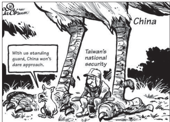
Taiwan's National Security: "With us standing guard, China won't dare approach."

Several policy recommendations in the NSR are worth noting. The NSR proposes to establish a “military buffer zone” where military forces from both sides are not allowed to enter without notification of each other. Taiwan has promised not to develop or use weapons of mass destruction. The document proposes that both sides establish a cross-Strait military security consultation mechanism and a military hotline, to avoid armed conflict, drawing inspiration from the US-USSR “Maritime Matter Incidents at Sea” Agreement of 1972 and the US-PRC Military Maritime Consultative Agreement. And finally, the document also suggests that Taiwan’s annual defense budget be increased to 3% of its GDP.