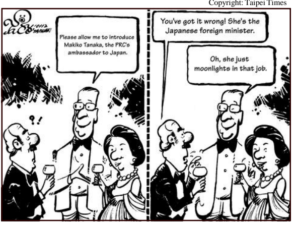
Center guest: Please allow me to introduce Mrs. Tanaka, the PRC's ambassador to Japan...

Tanaka's remarks betray her ignorance about many aspects of the Taiwan issue. First, only 13% of the 23 million people on Taiwan consider themselves strictly as Chinese. A great majority of the Taiwanese have clearly rejected unification with the People's Republic of China (PRC) under the Hong Kong model of "one country, two systems." Taiwan, like Japan, is a free market democracy. The Taiwanese people have struggled long and hard against the Kuomintang dictatorship with blood and tears to win their freedom. They will not peacefully give up