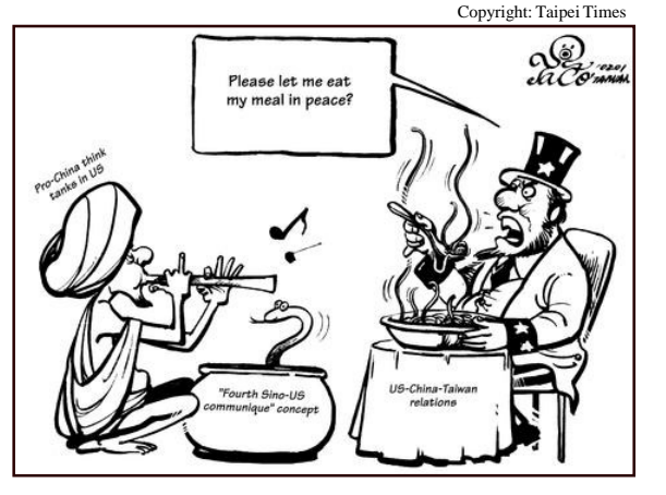
US to pro-China "Fourth Communiqué" lobby: "Please let me eat my meal in peace."

Ambiguity has its downside, of course and even the Taiwan Relations Act has its share of it. Whenever a threat exists to Taiwan, under the