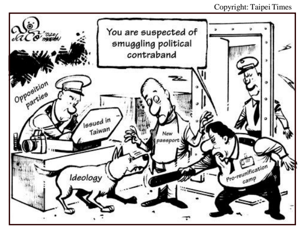
Commotion over passport issue: "You are suspected of smuggling political contraband."

The problem is of course that Beijing — and its pro-unification lackeys in the opposition parties in Taipei — have been trying for years to portray Taiwan as somehow being a province of China. This is the equivalent of saying