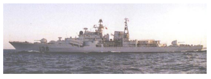
One of two Russian Sovremenny destroyers on its way to China

The article quotes the Stockholm International Peace Research Institute as saying that in 2000 China became the world's biggest importer of