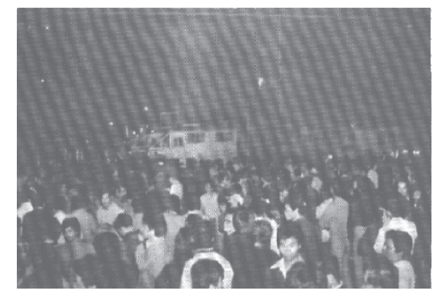
Riot trucks moving towards the crowds

The crowd calls out: Yes, yes, yes, watch out for them.