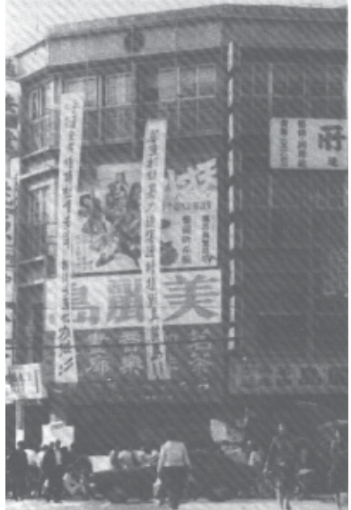
The Formosa Magazine office with banners hanging from the windows

Here we present some important excerpts from the tape transcript. The full transcript will be published at a later date.