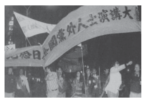
Banners at the beginning of the march

However, we ourselves and others sympathetic to the Democratic Opposition have doubted the official version, and have presented evidence which showed that the police encircled and then moved