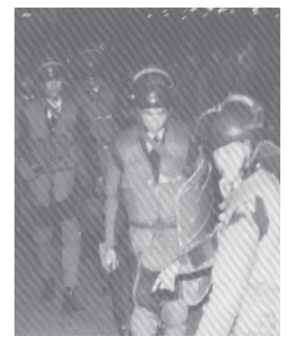
Havily armed riot police advance towards demonstrators

More noise from disturbances in the crowd.